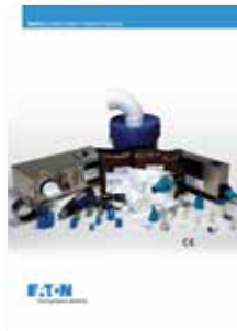
Hose Cleaning Systems E-HOIN-TT032-E2