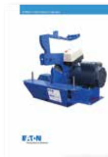
Hydraulic Hose Saws – ET9300 E-EQSW-BB001-E