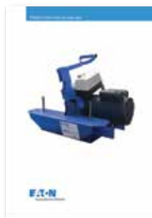
Hydraulic Hose Saws – ET9200 ET9200-10-220 Hydraulic Hose Saw April 2015