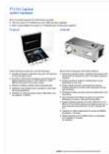
Hose Capping Systems E-HOIN-TT032-E2